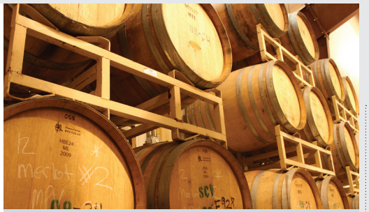
Mesa County Libraries have documented the local winemaking process from grape to glass. Palisade winery Maison la Belle Vie allowed our cameras to film its private vineyard and production facilities. Watch the video online at bit.ly/winery_mcl