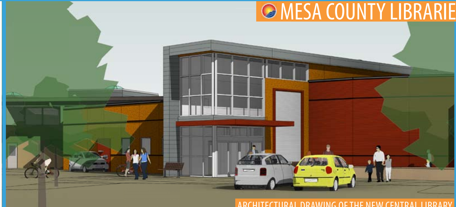
ARCHITECTURAL DRAWING OF THE NEW CENTRAL LIBRARY