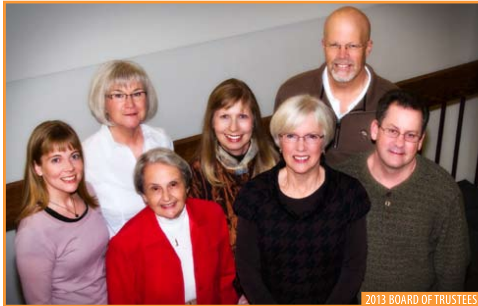
2013 BOARD OF TRUSTEES