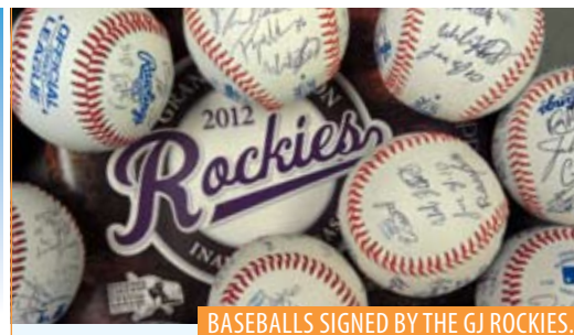
BASEBALLS SIGNED BY THE GJ ROCKIES.